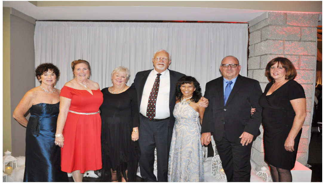
CONGRATULATIONS 2019 BOARD OF DIRECTORS