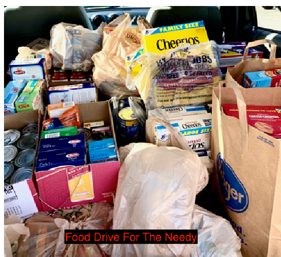
Food Drive For The Needy