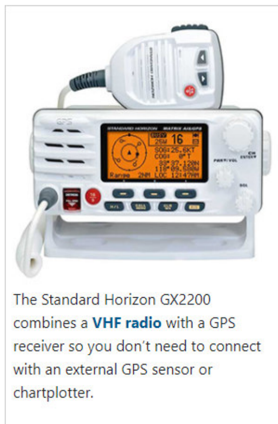
The Standard Horizon GX2200 combines a VHF radio with a GPS receiver so you don't need to connect with an external GPS sensor or chartplotter.

Just push and hold down the red DISTRESS button on your VHF radio, and it sends an automated digital distress message to the Coast Guard and all other DSC radio-equipped vessels. Rescuers instantly know who you are, where you are (using GPS coordinates), the name of your boat and the phone numbers of your emergency contacts.